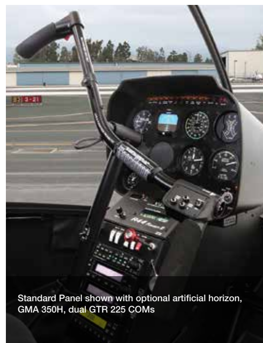
Standard Panel shown with optional artificial horizon, GMA 350H, dual GTR 225 COMs