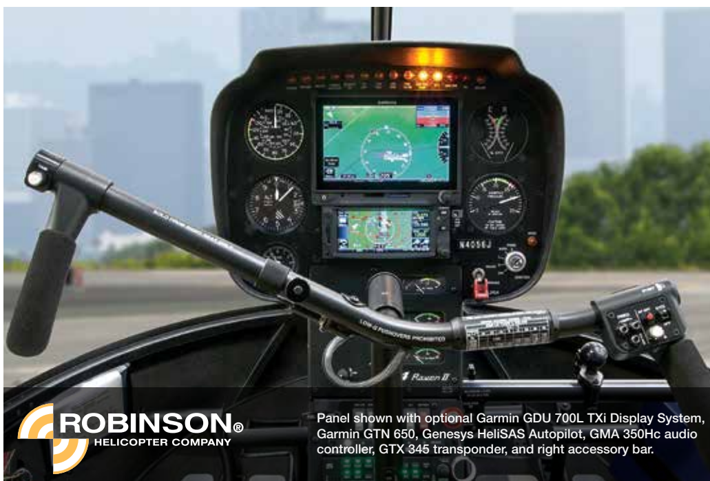
Panel shown with optional Garmin GDU 700L TXi Display System, Garmin GTN 650, Genesys HeliSAS Autopilot, GMA 350Hc audio controller, GTX 345 transponder, and right accessory bar.